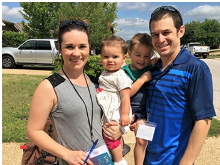
Peace Lutheran Church – Liberty Hill, Tex.

Many WELS Home Missions are taking advantage of Praise and Proclaim as a part of their overall outreach strategy. As it stands currently, 10 home missions have participated in Praise and Proclaim outreach initiatives in 2016 and 2017, with another two home missions scheduled to participate so far in 2018. Today, 487 people have been trained how to share the gospel message. Thanks to their efforts and the Holy Spirit working through them, the seed of the gospel has been planted about 3,800 times.